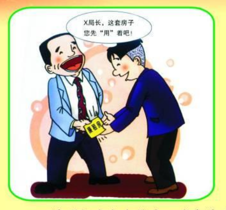
1-6、违反规定多占住房,或者违反 规定买卖经济适用房、廉租住房等保障 性住房。